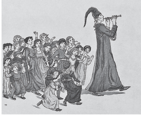
The Pied Piper of Hamelin

Perspicacious and with the best interests of future generations at heart, you initiate a program of curriculum distillation to determine what, among all the subjects, is the most important one to offer, and like a fine whisky that not only packs a punch but imparts a multiplicity of sensory experiences, you determine that it is reading, for if you teach a student how to read and read well, he can potentially teach himself everything he needs to know.